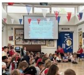
VE Day 80