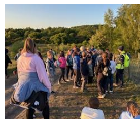
Year 6 PGL