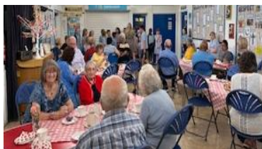
Parish Strawberry Tea